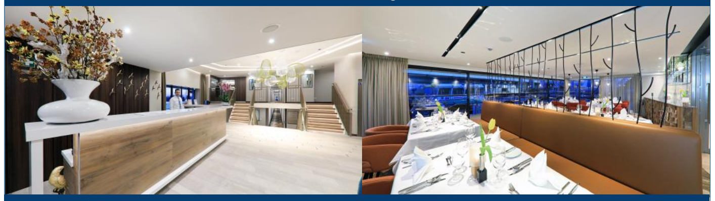
Lobby Area / Reception