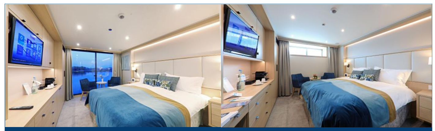
Cabin with french balcony